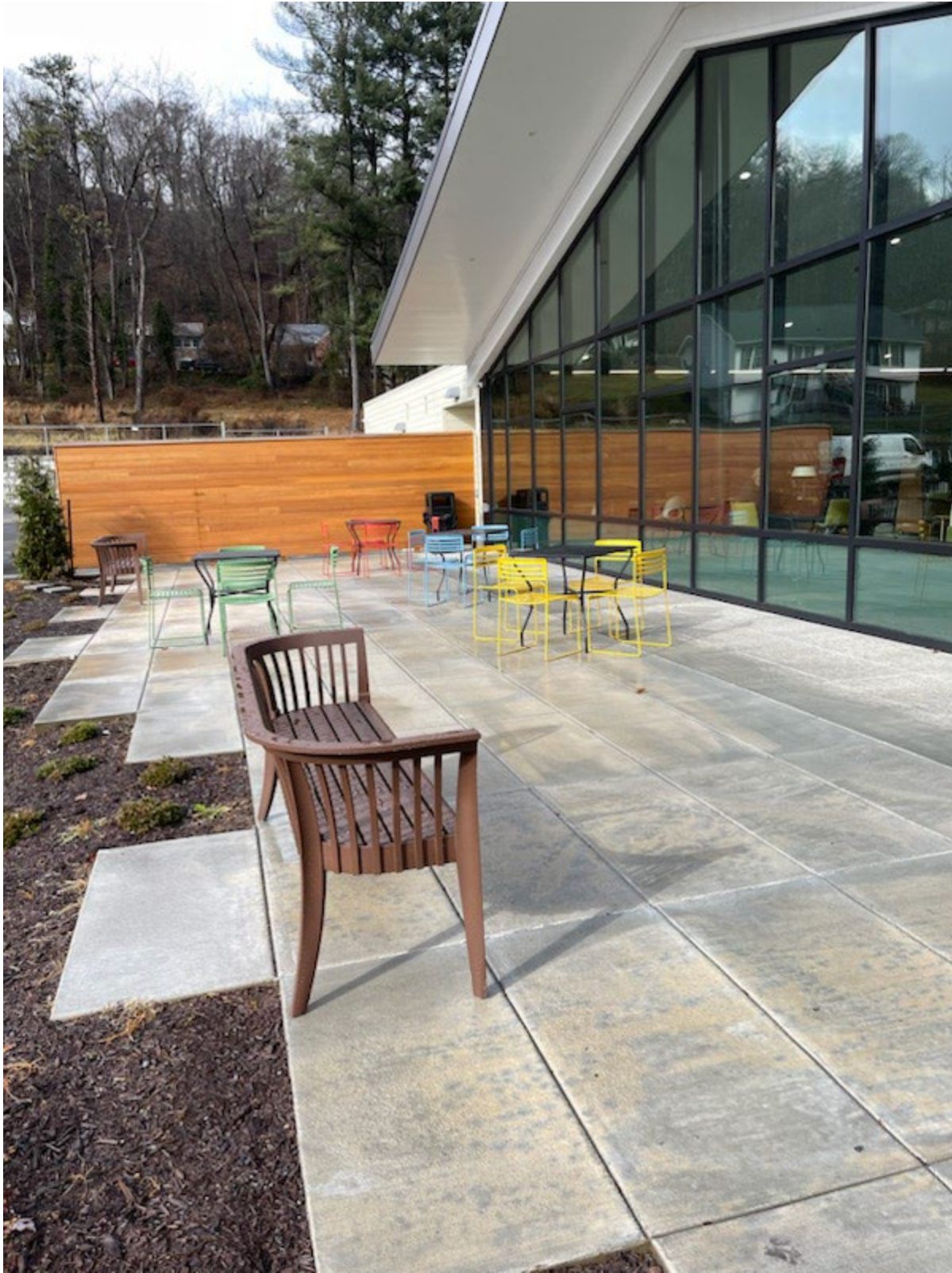
*The above image shows view of the patio looking from the edge of the stormwater management area.